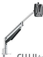
CLU II (with mounts)