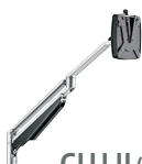
CLU II (without mounts)