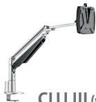
CLU III (with mounts)